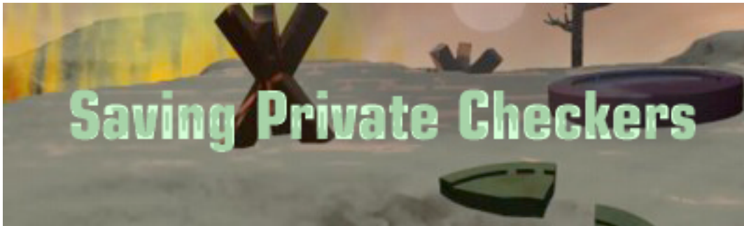
Free Game # 42 from Invisible City Productions, Inc.